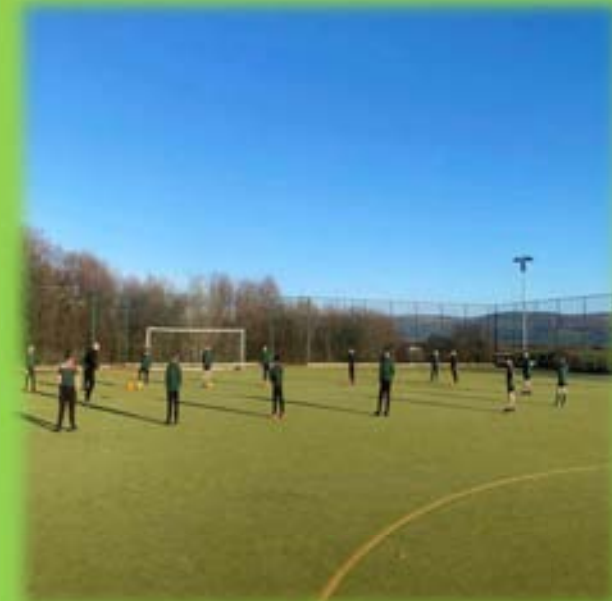
Barrow Raiders Enrichment Session

#takepart #enrichement #TakeResponsibility #coldoutsdie