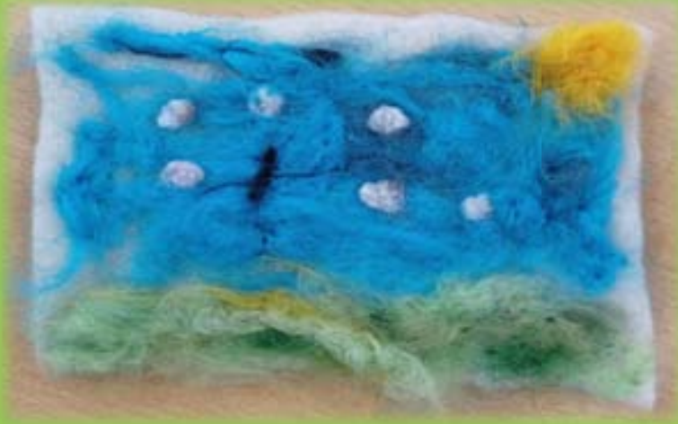
Needlecraft Club Enrichment—Needlecraft work