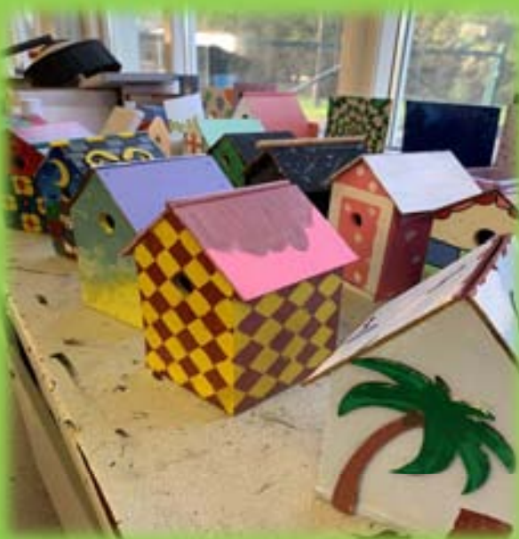
Year 8 Bird Boxes—Technology

PLEASE INFORM SCHOOL OF ANY STUDENT ABSENCES BEFORE 9:30AM. THANK YOU.