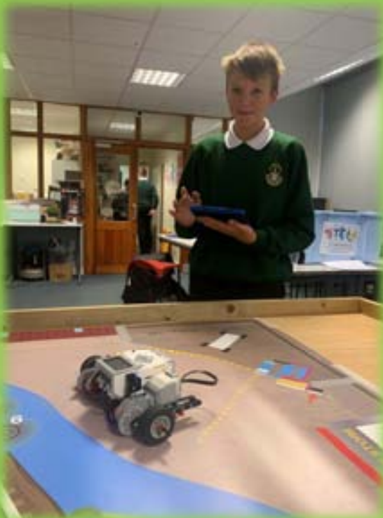
BAE Enrichment Workshop with BAE—Robots

“Once you choose hope, anything's possible.”