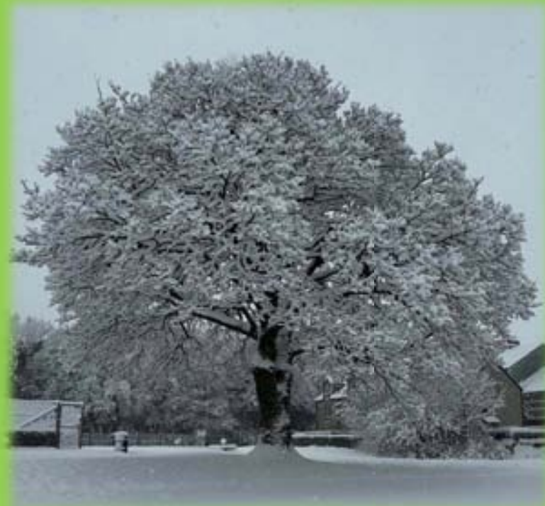
on Millom School Site on 2 December 2023

#takepart #TakeResponsibility #cumbriayouthalliance