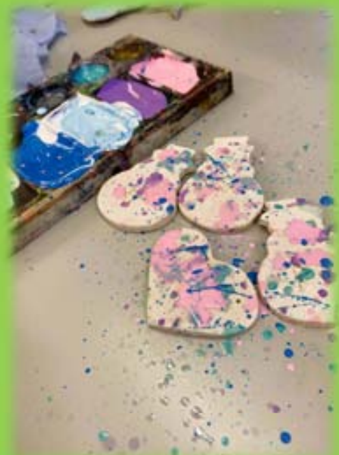
Craft Club Enrichment—Salt Dough Decorations